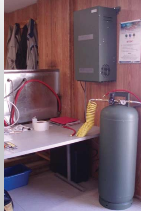
N2-GEN ® 4 without Hard Case