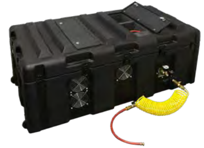
Fully operable with case closed for protection.