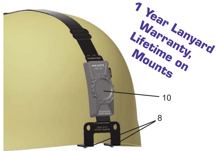
L4 G24 Mount with Low Profile Breakaway Base

The Wilcox L4 NVG Mounting Systems Product Line is featured with a wide range of adjustments to customize the position of the Night Vision Goggle for proper eye position, and provide a maximum low profile position to the helmet.